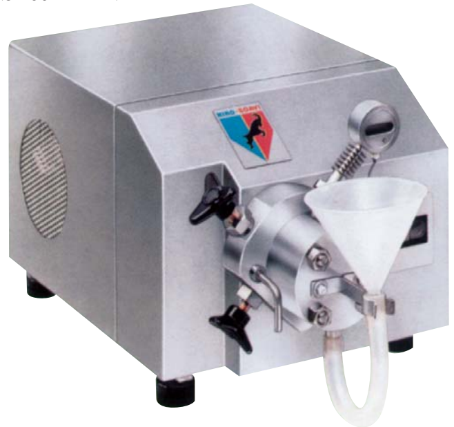
NS 1001L - PANDA

Although Niro Soavi homogenizers are renowned for their industrial performance, there is available a range of low capacity homogenisers designed for laboratory and pilot plants. Even 10 litres/hour can be handled at pressures upto 1500 bar. Higher pressure (2000 bar) are possible in a batch processing mode, homogenising samples of volume as low as 0.1 litre. Instrumentation is supplied according to individual requirements.