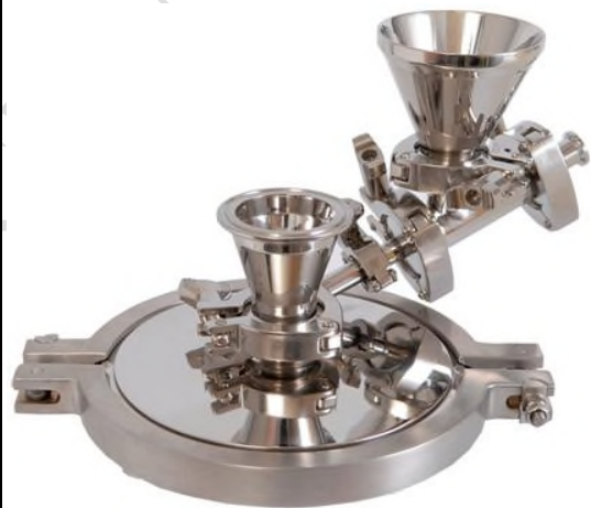
Fluid Jet mill J-200